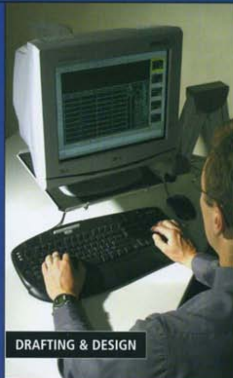
DRAFTING & DESIGN

A family-owned company, Online Laser has provided services to steel manufacturers and fabricators since 1998. Due to uncompromising quality and efficient service, the business has continued to grow, developing a network of clients throughout the country.