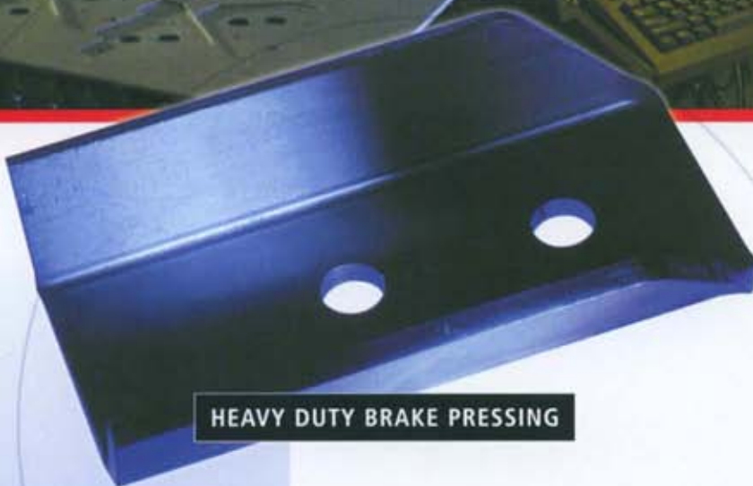
HEAVY DUTY BRAKE PRESSING