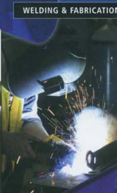
WELDING & FABRICATION