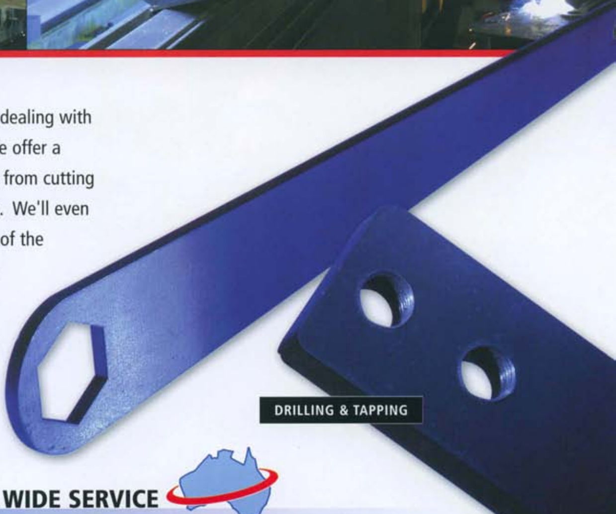
DRILLING & TAPPING

The difference in dealing with Online Laser is we offer a complete service, from cutting to brake pressing. We'll even organise coating of the finished product.